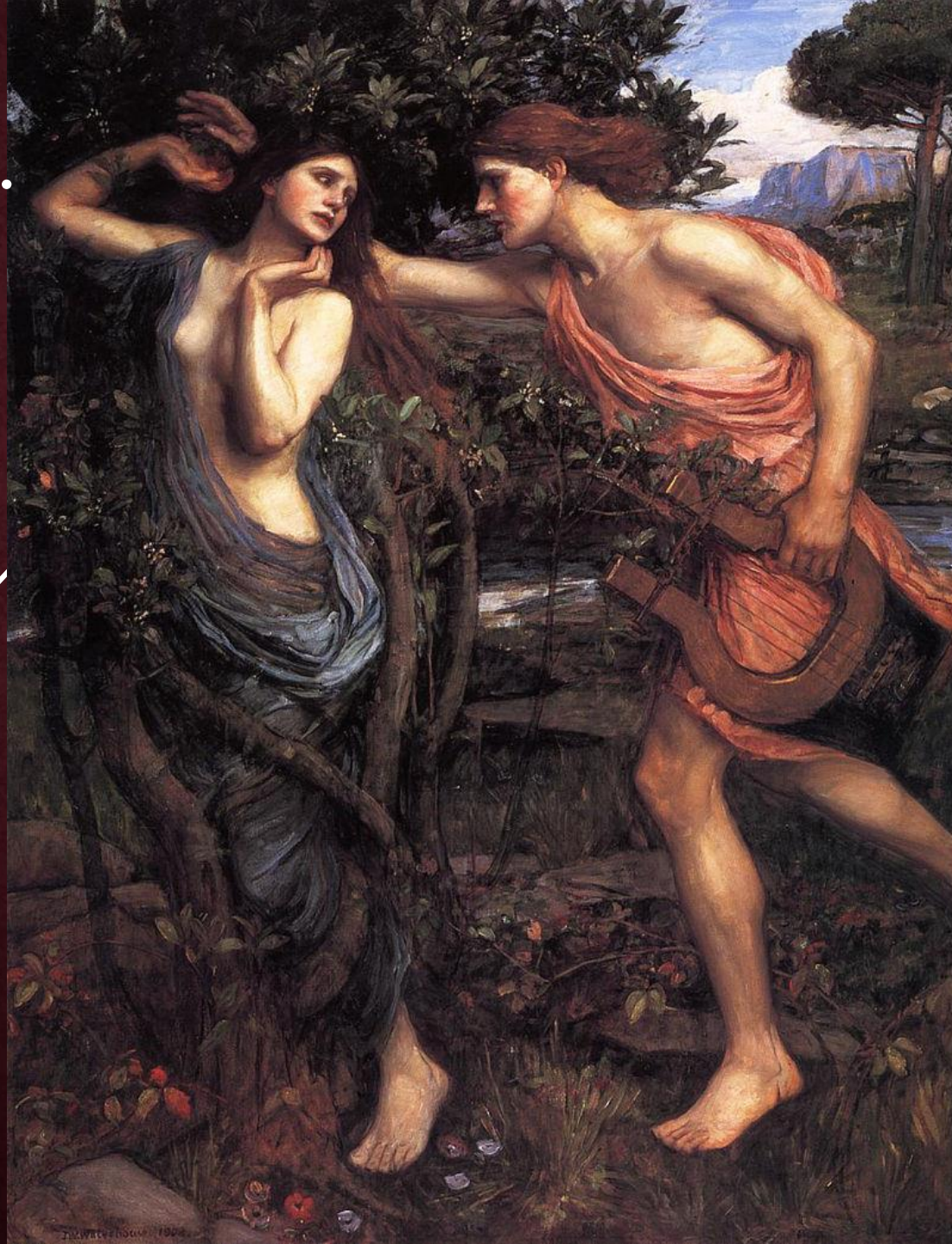
Apollo e Dafne, J.W. Waterhouse

...the role of OTs in understanding the needs for and issues with intimacy for our clients.