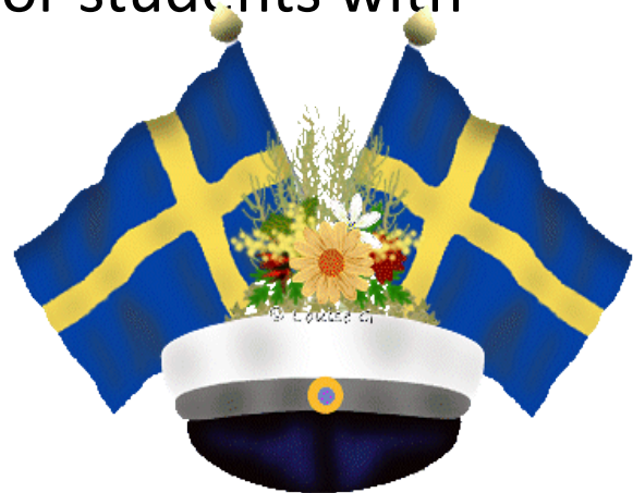
Student graduating cap in Sweden)