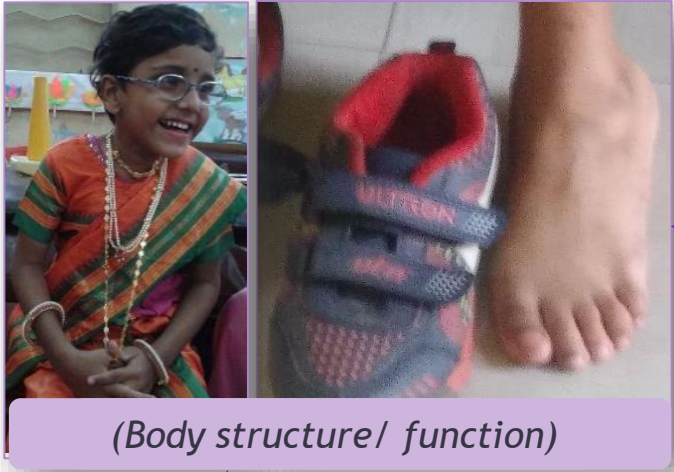
(Body structure/ function)