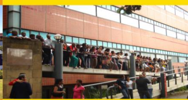
NELSON R MANDELA SCHOOL OF MEDICINE