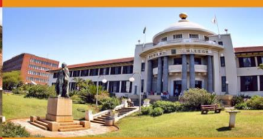
HOWARD COLLEGE CAMPUS