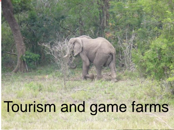
Tourism and game farms